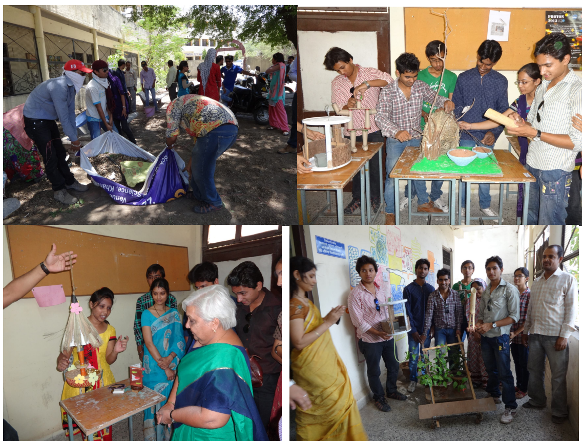
Photos of the activities -